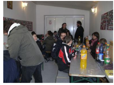
small recreation room