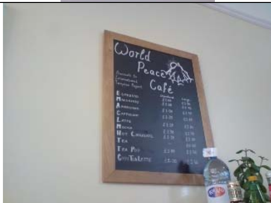
World Peace Cafe sign

An important Bodhisattva in Kadampa Buddhism