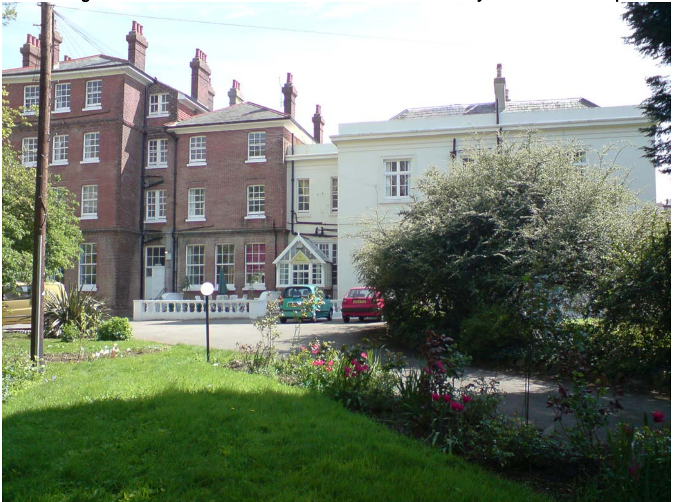
A Buddhist place of worship, and The World Peace Cafe & Peace Garden open to the public