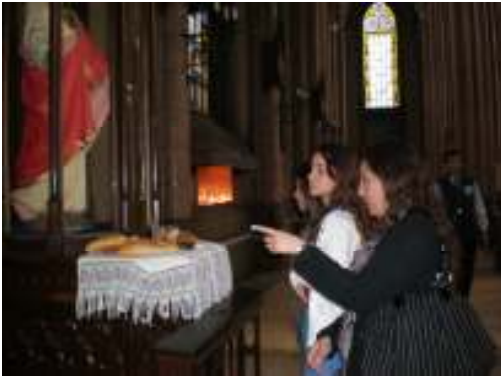
BREAD AND WINE

WHEN YOU WANT YOUR WISHES TO COME TRUE YOU NEED TO LIGHT A CANDLE AND PRAY