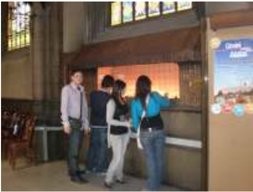
CANDLES FOR WISHES

WHEN YOU WANT YOUR WISHES TO COME TRUE YOU NEED TO LIGHT A CANDLE AND PRAY