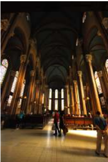
INTERIOR VIEW OF THE CHURCH